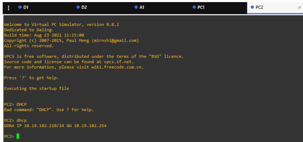
Figura 11. Verificación de DHCP ipv4 en PC2

Paso 2.7: Verifique los servicios DHCP IPv4.